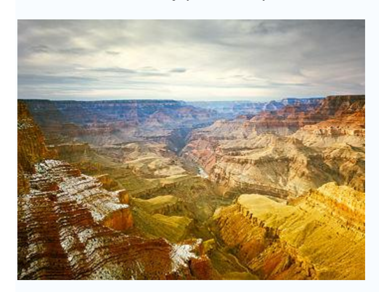
South Rim December 2006

The Grand Canyon is a colorful steep-sided gorge carved by the Colorado River in the U.S. state of Arizona. It is largely contained within the Grand Canyon National Park — one of the first national parks in the United States. President Theodore Roosevelt was a major proponent of preservation of the Grand Canyon area, and visited on numerous occasions to hunt and enjoy the scenery.